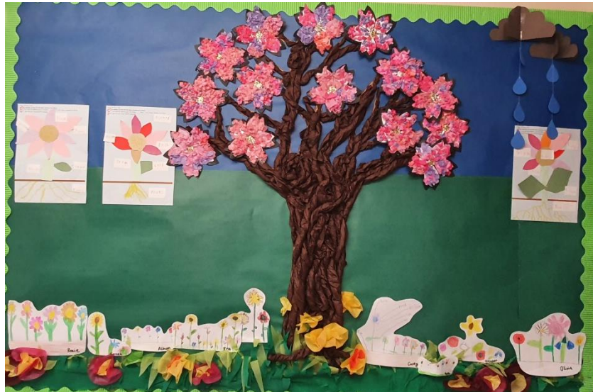
Spring has 'Sprung' in Year 1 (Larch)