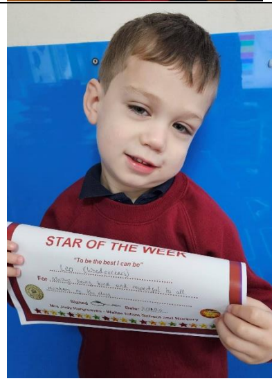
Rosaleigh in Magpie