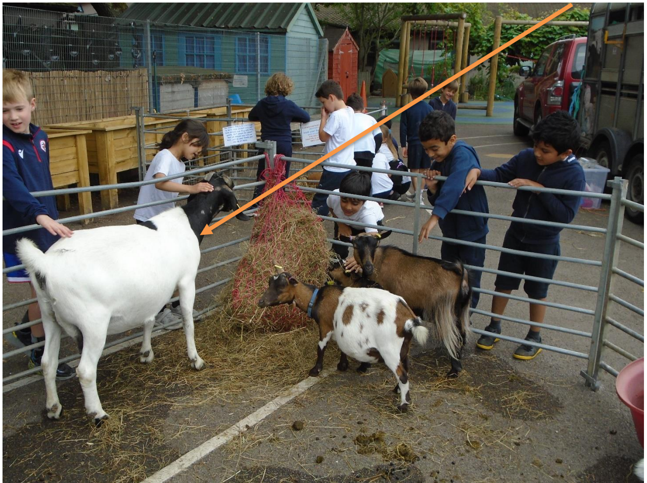
Even the children from Meadow Nursery who are joining us in September were able to come and visit the animals.