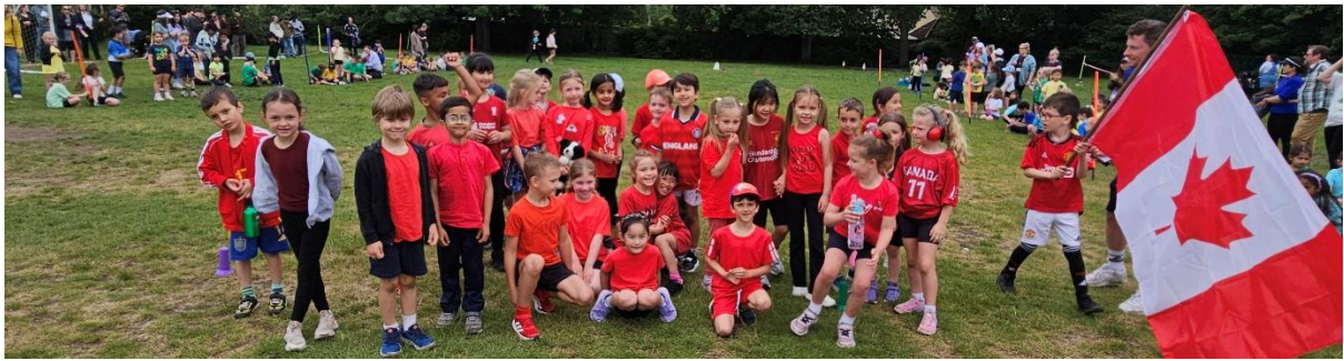
Pine Class won the Golden Baton! Well done Pine!