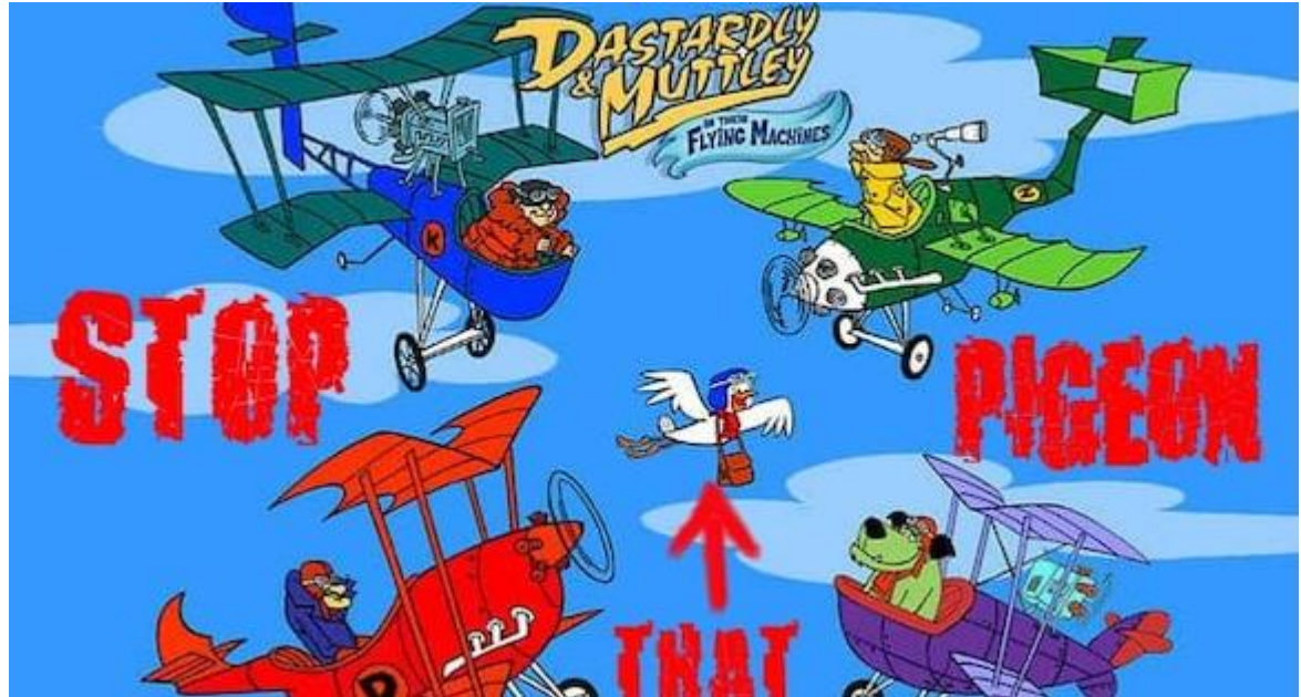
I know our parents will all be too young to remember this, but some of our grandparents may!!!