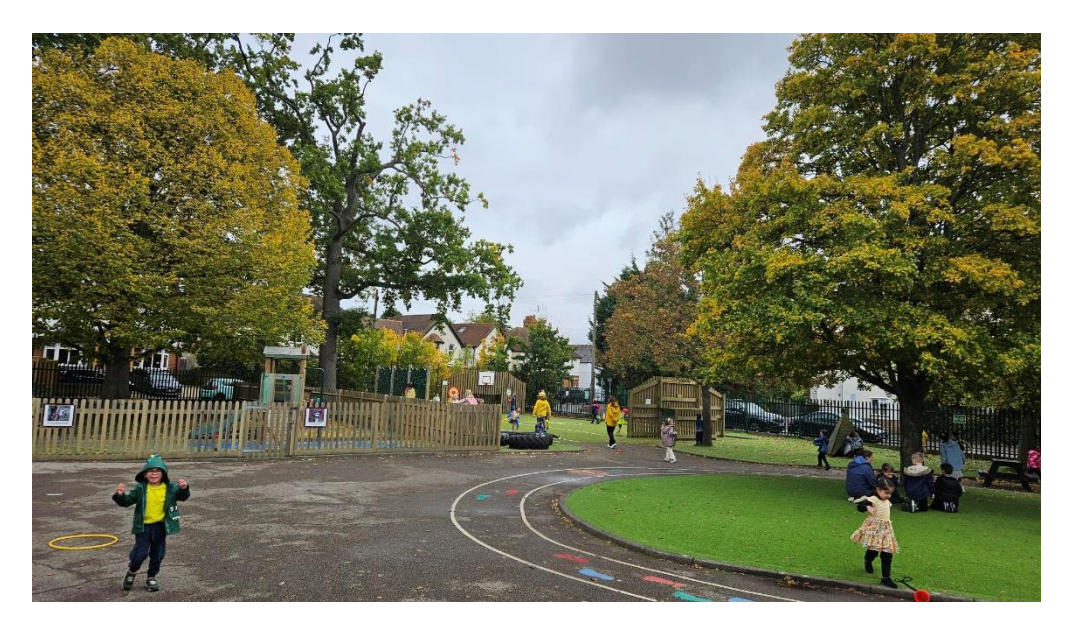
I am a fan of an acrostic poem and shared this with our children in assembly today: