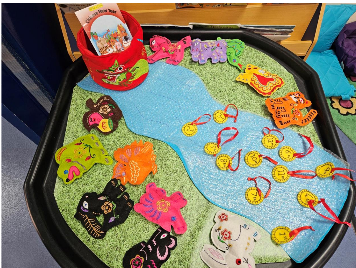
This is the tough tray in Magpie; every class has a set of the animals!