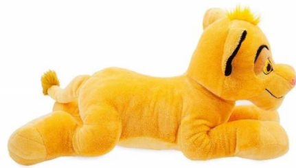
A MASSIVE SIMBA