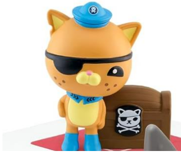
A Kwazii Tonie!