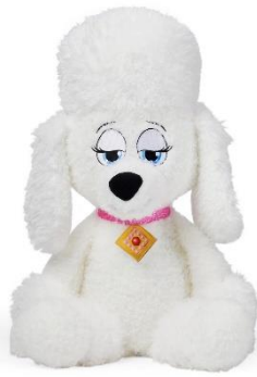
29" Delores from PP