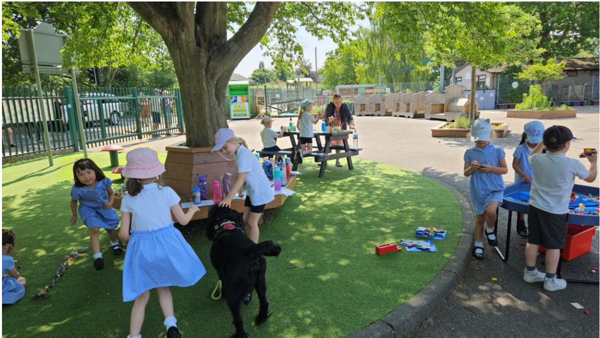
Walter loved joining in too!