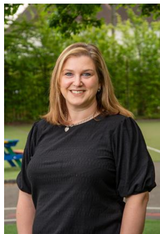
Early Years Practitioner