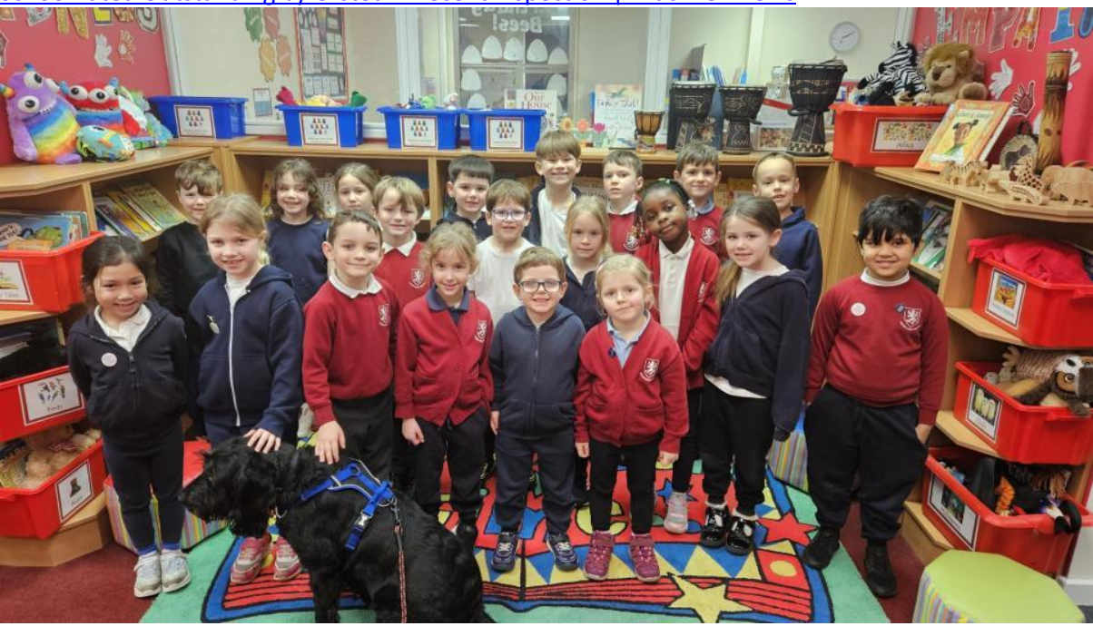
We will be having our elections in the week beginning 3<sup>rd</sup> February with the results being shared on Friday 7<sup>th</sup> February in assembly.