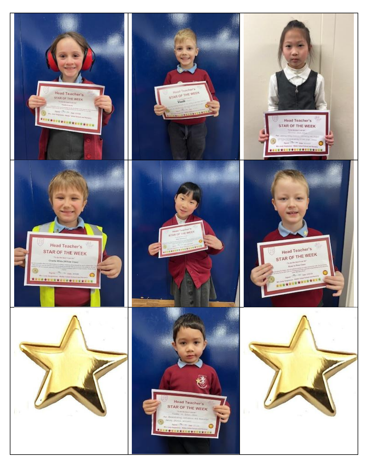
If you are struggling to provide all you need to at the moment; we can provide Food Vouchers for the Foodbank and fuel vouchers.