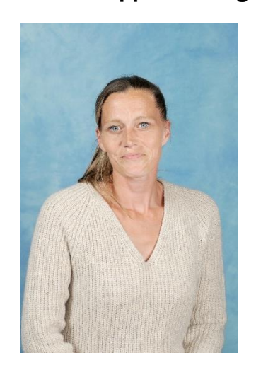
Learning Support Assistant